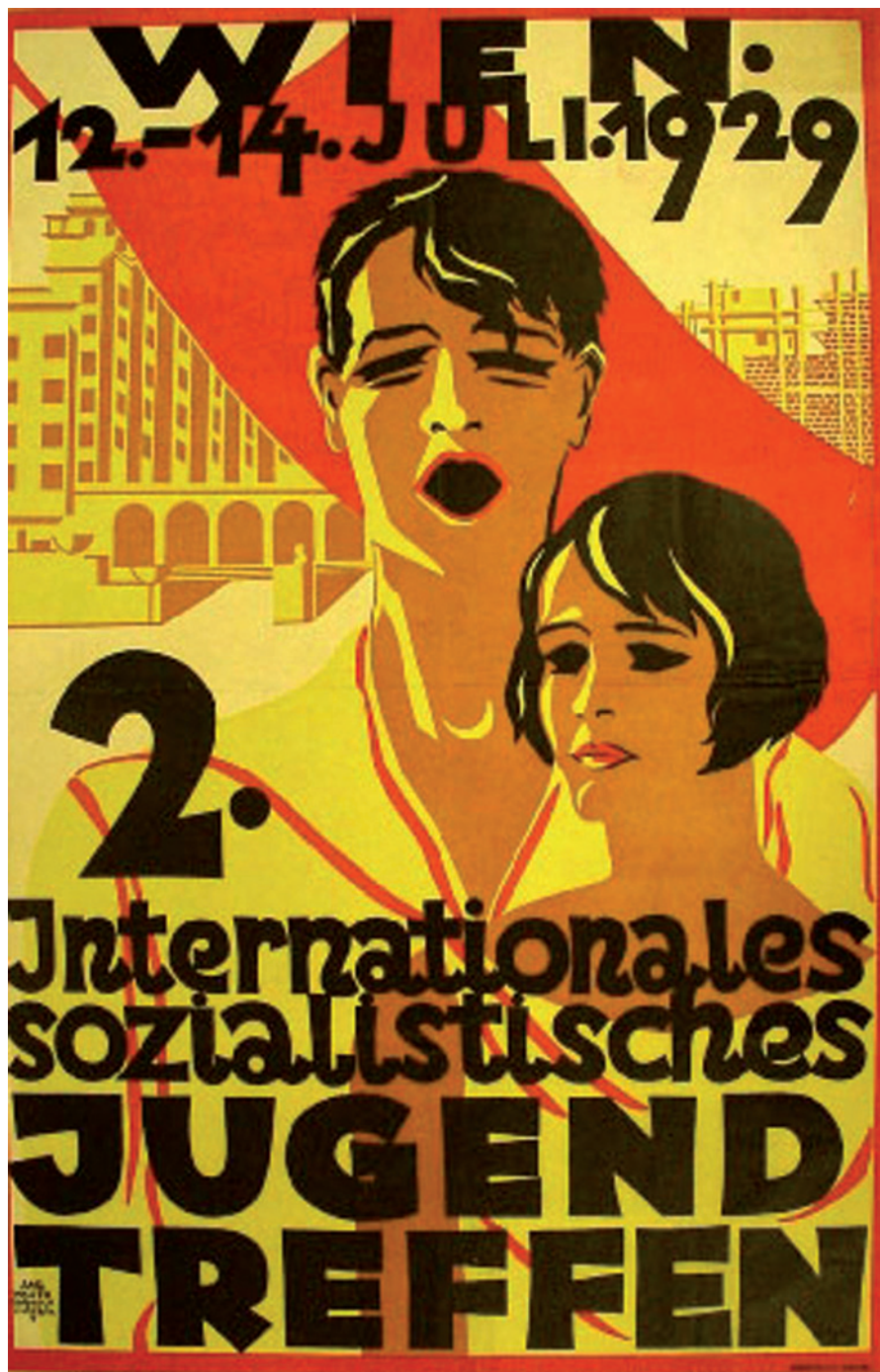
4) V&A, Wien, Plakatsammlung