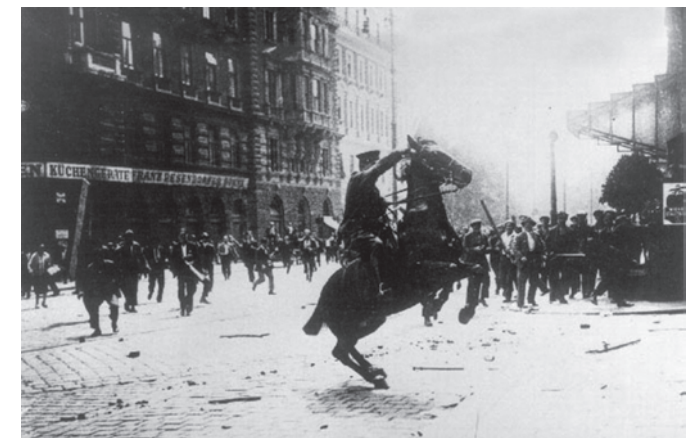
2)