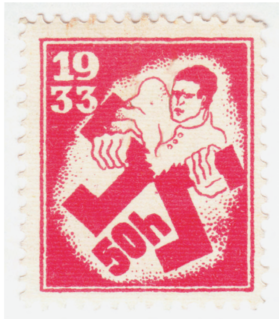
5) National Archives, Police Headquarters in Prague II – Presidium